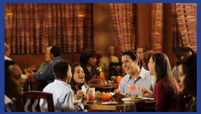
The Wave ... of American Flavors at Disney's Contemporary Resort